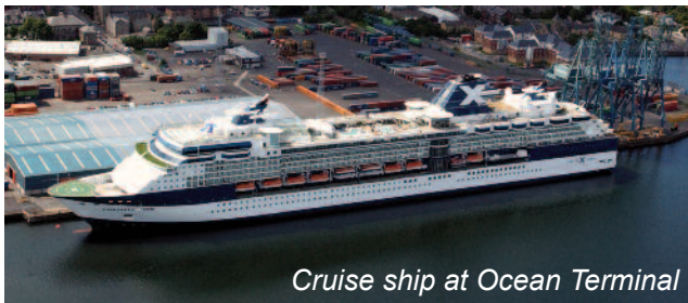
Cruise ship at Ocean Terminal

2015 is expected to be the busiest year yet at Greenock Ocean Terminal, with a total of 56 ships expected to call this season - seven more than last year.