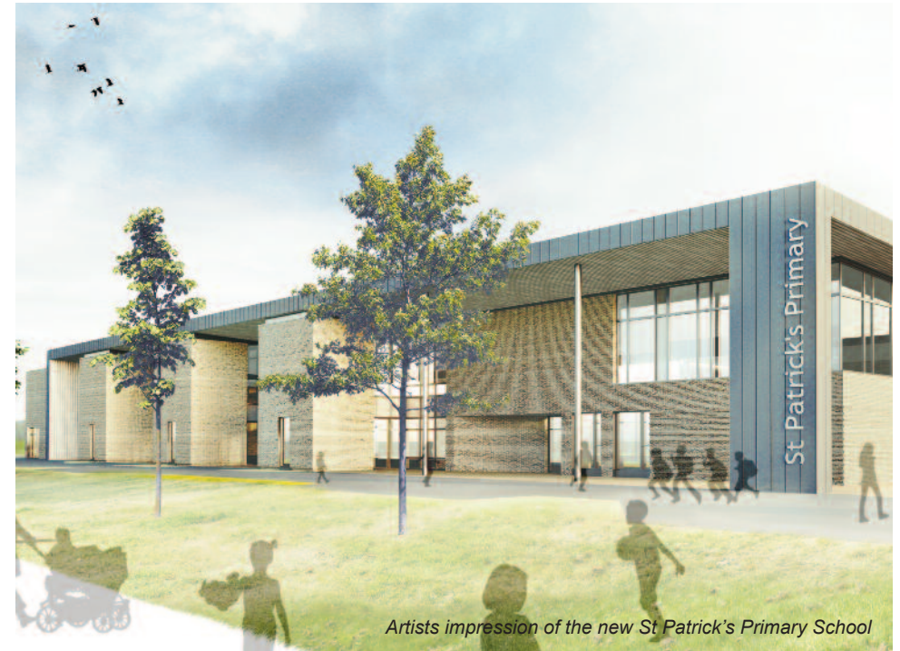
Artists impression of the new St Patrick's Primary School

The £3.9 million refurbishment of Kilmacolm Primary has been brought forward and will see staff and pupils move temporarily to the former St Stephen's High School in Autumn 2015. The nursery school will remain on site in temporary modular accommodation. The project is scheduled to be completed by October 2016.