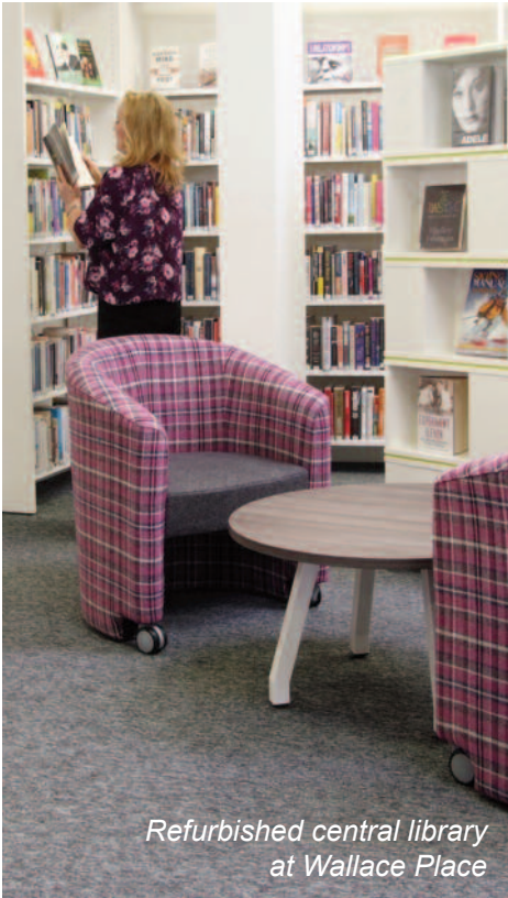
Refurbished central library at Wallace Place

More information and online services can be accessed via: www.inverclyde.gov.uk/education-and-learning/libraries