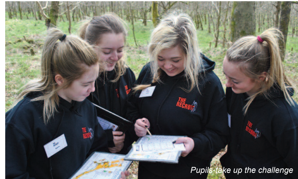
Pupils take up the challenge