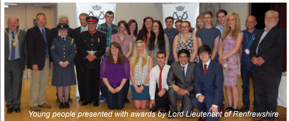
Young people presented with awards by Lord Lieutenant of Renfrewshire

Inverclyde schools have the highest Duke of Edinburgh Award participation rate per head of population in Scotland.