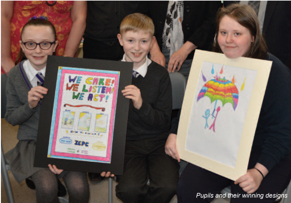
Pupils and their winning designs

primary, secondary and additional support needs schools across the area. It was a tough job picking the winners but I am sure the designs we have chosen will get the campaign message across in a colourful and engaging way.” The winning pupils have worked with Inverclyde Council’s graphic design team to create a poster based on their design. The campaign, launched this month, will see posters appearing in every school and on selected billboards around Inverclyde. The campaign complements ongoing activity such as the Nurturing Inverclyde approach, Rights Respecting Schools Awards and the Childline programme delivered in primary schools.