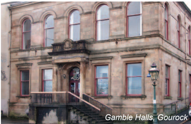
Gamble Halls, Gourrock

Inverclyde Council's Environment and Regeneration Committee has approved over £800,000 on new projects as part of its capital investment programme.