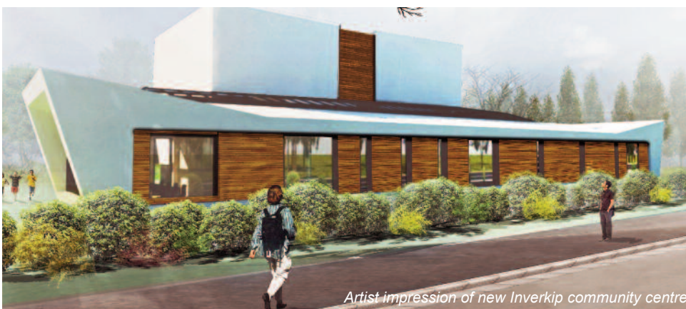
Artist impression of new Inverkip community centre

New designs have been revealed and planning permission agreed for a brand new community centre for Inverkip.