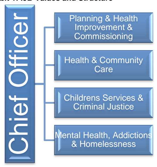
Exhibit 1: IJB Values and Structure

The IJB Strategic Plan is supported by an operational plan and a variety of service strategies, investment and management plans which aid day to day service delivery. These plans and strategies identify what the IJB wants to achieve, how it will deliver it and the resources required to secure the desired outcome. The Strategic Plan also works in support of the Inverclyde Community Planning Partnership's Single Outcome Agreement and the NHS Greater Glasgow & Clyde Local Delivery Plan. It is vital to ensure that our limited resources are targeted in a way that makes a significant contribution to our objectives.