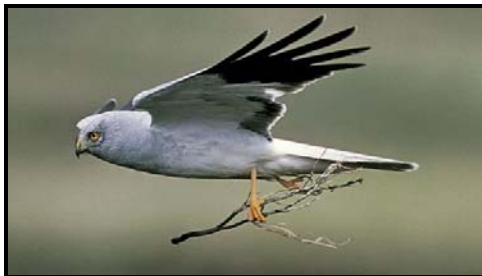
Hen harrier (m)

In general, the less intensively used upland areas provide a valuable resource for wildlife with a wide range of invertebrates, birds and mammals supported including, for example, the skylark, curlew, golden plover and lapwing, red grouse and hen harrier.