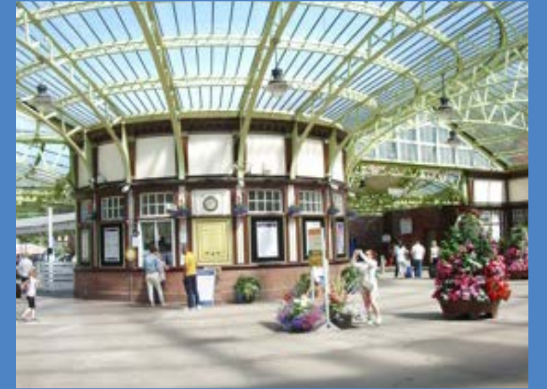
WEMYSS BAY STATION, WEMYSS BAY