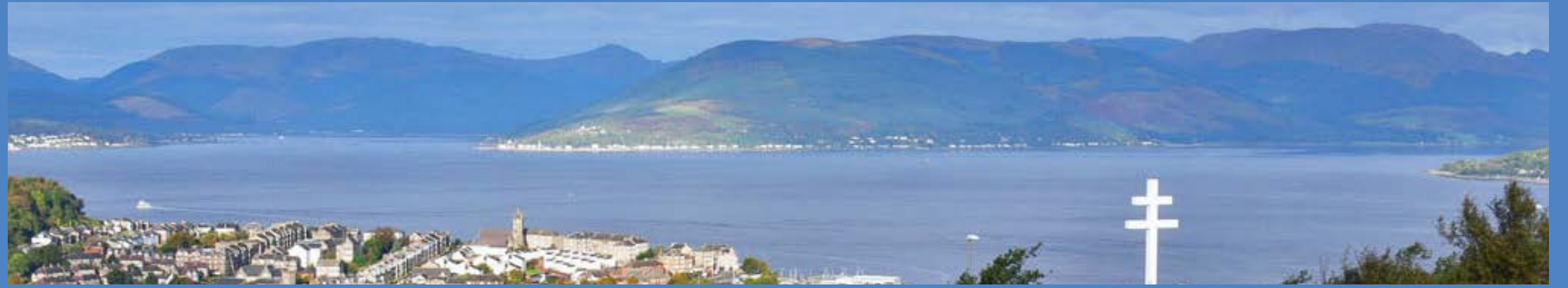
VIEW FROM LYLE HILL, GREENOCK