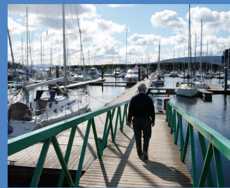
INVERKIP MARINA, INVERKIP