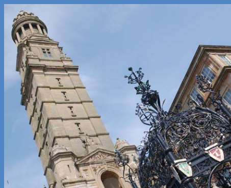
CLYDE SQUARE, GREENOCK