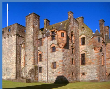
NEWARK CASTLE, PORT GLASGOW