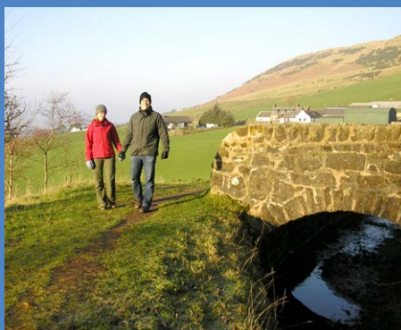
THE CUT, GREENOCK