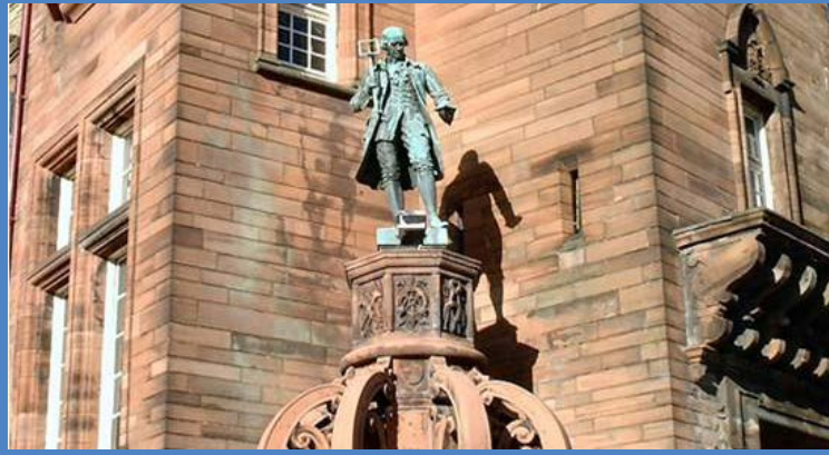
STATUE OF JAMES WATT, GREENOCK