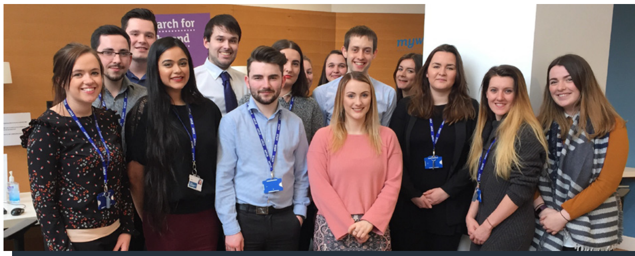
Current and former members of our Young Talent Programme

We also offer a full range of supportive and flexible policies and procedures , allowing our colleagues to balance their work with caring responsibilities, further study, or to enter flexible retirement; with more than one in five colleagues choosing to work part-time hours.