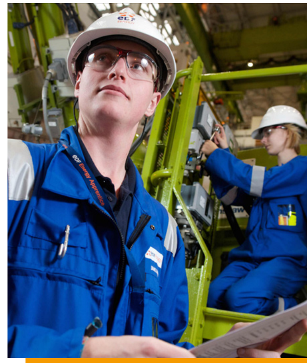
EDF Energy Apprentices

Our local team responds quickly when situations arise and can assist businesses to try and minimise the risk of redundancy before it happens. We support businesses of any size, no matter how many employees are involved . It's free of charge, and helps ease some of the strain of dealing with redundancy. For employees, we offer free, impartial advice on dealing with the practical and emotional sides of redundancy. PACE advisers help people recognise their skills, explore their options and prepare for their next move .