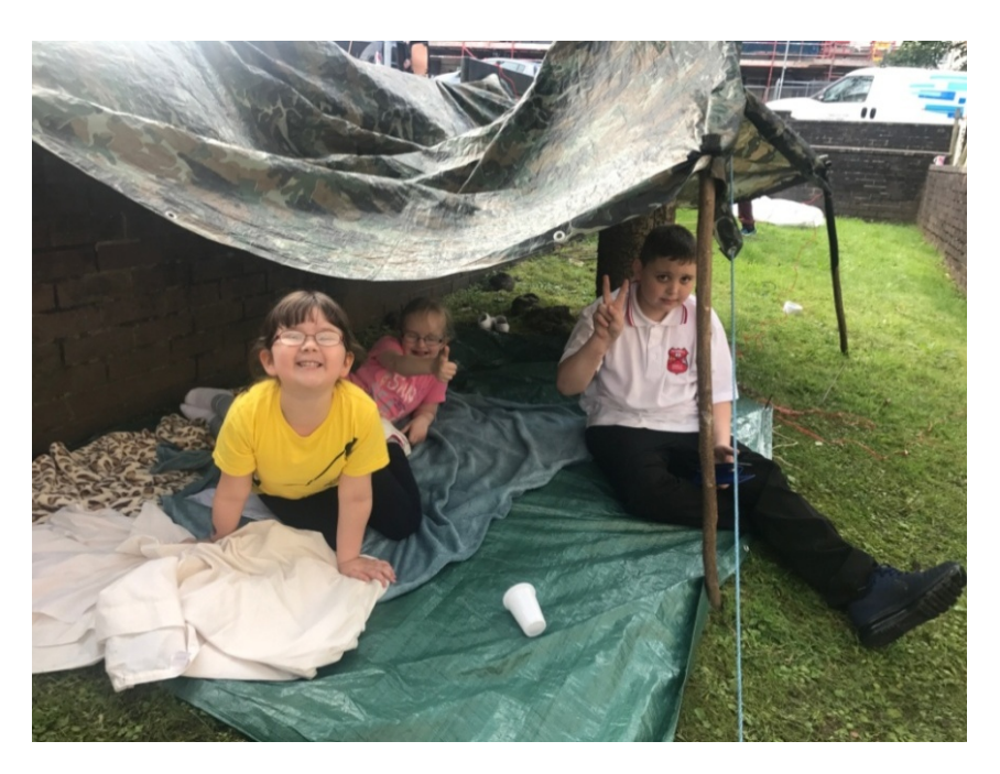
4.4.2 Radio Clyde Cash for Kids Christmas Fund

In order to tackle poverty over Christmas, RCH successfully gained £475 from the Radio Clyde Cash for Kids Christmas Grant to help families in financial hardship over the festive season. 19 local children received £25 vouchers for a shop of their choice and a selection box.