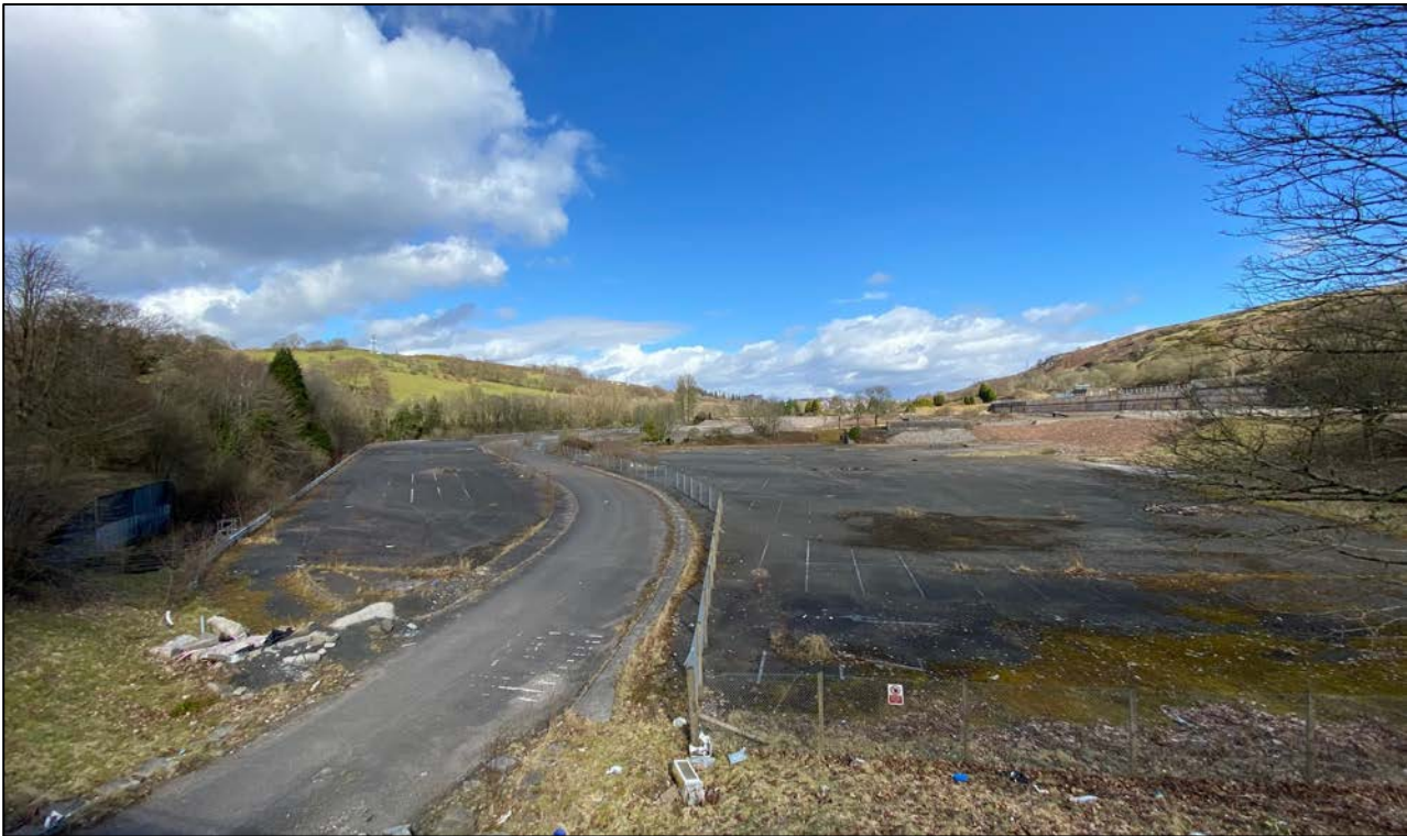
View looking north across the site

SEPA has no objection in principle to the proposal. It specifically notes that the FRA recommends that the existing headwall is retained, or replaced with a headwall 48.5m AOD so that the culvert will surcharge, but not flood the site. Considering whether the daylighting of the watercourses may result in an increase in floodwater downstream of the development, SEPA notes that when considering flood risk for the site, the FRA has taken a conservative approach and not taken into account any attenuation by the basin that is near the culvert. Once this attenuation is considered, the FRA states that the detention storage of the landscape is likely to offer a reduction in flow peak reaching the adjacent reach of Spango Burn. SEPA is generally in agreement that there is unlikely to be an increase in flood risk downstream as a result of the development.