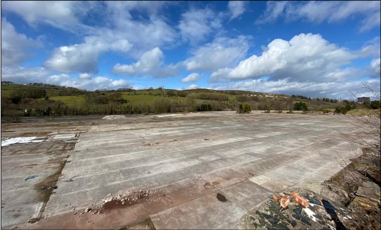
View looking north across the site towards the A78

the proposed percentage split of uses also fails to accord with the preferred strategy set out within both the adopted and proposed LDPs and respective draft Supplementary Guidance. Based on the indicative proposals the development would also see the entire expected residential development capacity for the wider Priority Place as identified in the proposed Local Development Plan on just part of the site.