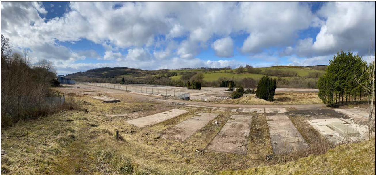
Looking west across the site from the path to the station

Whilst this potential impact is noted, the funding of healthcare is an issue for others. GP practices for example are often run as individual businesses who make a business case to expand and establish the practices. Given the development would be phased over a 10-year period and that the application site forms part of an identified redevelopment opportunity within the adopted and proposed LDPs, it is considered that local healthcare providers have sufficient opportunity to anticipate and phase any business cases to take account of the development.