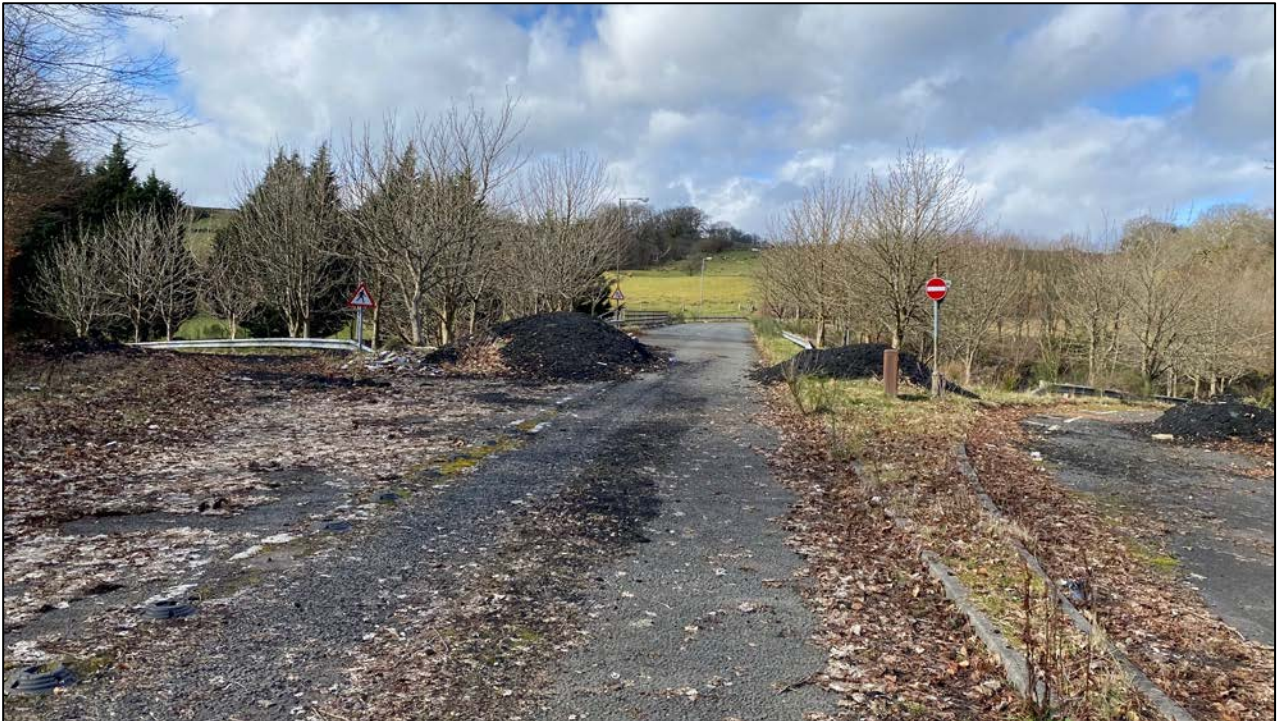
Access to the site from the grade separated junction on the A78

A Framework Sustainable Transport Strategy (STS) and Framework Travel Plan have been provided within the supporting documentation and detail general outcomes including; the proposed re-opening of the IBM railway station; an internal layout designed to encourage sustainable travel, providing the ability to accommodate buses; a new pedestrian link between the proposed development and Braeside; and the upgrade of the eastern development access offering a safe crossing point.